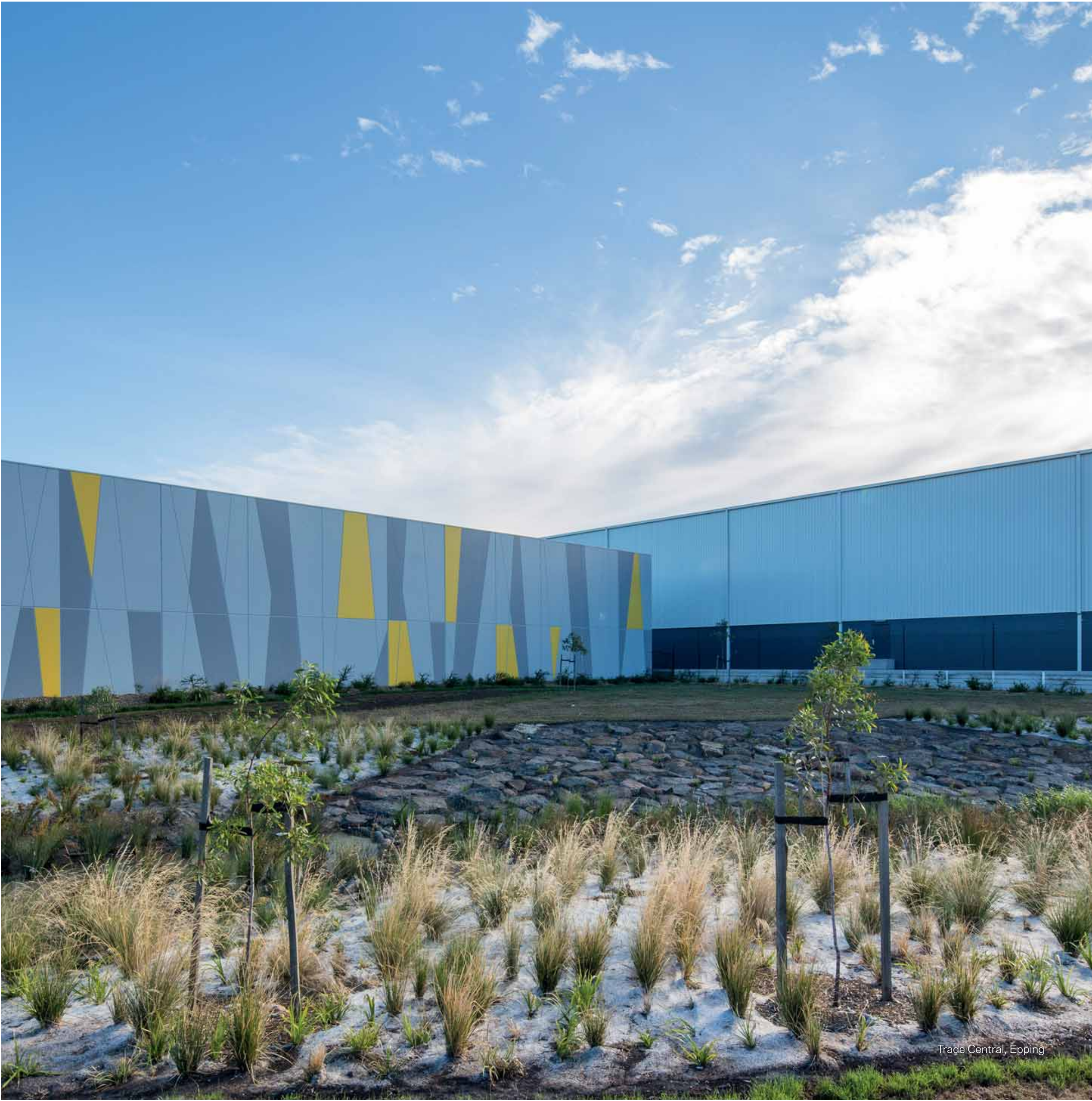
Trade Central, Epping