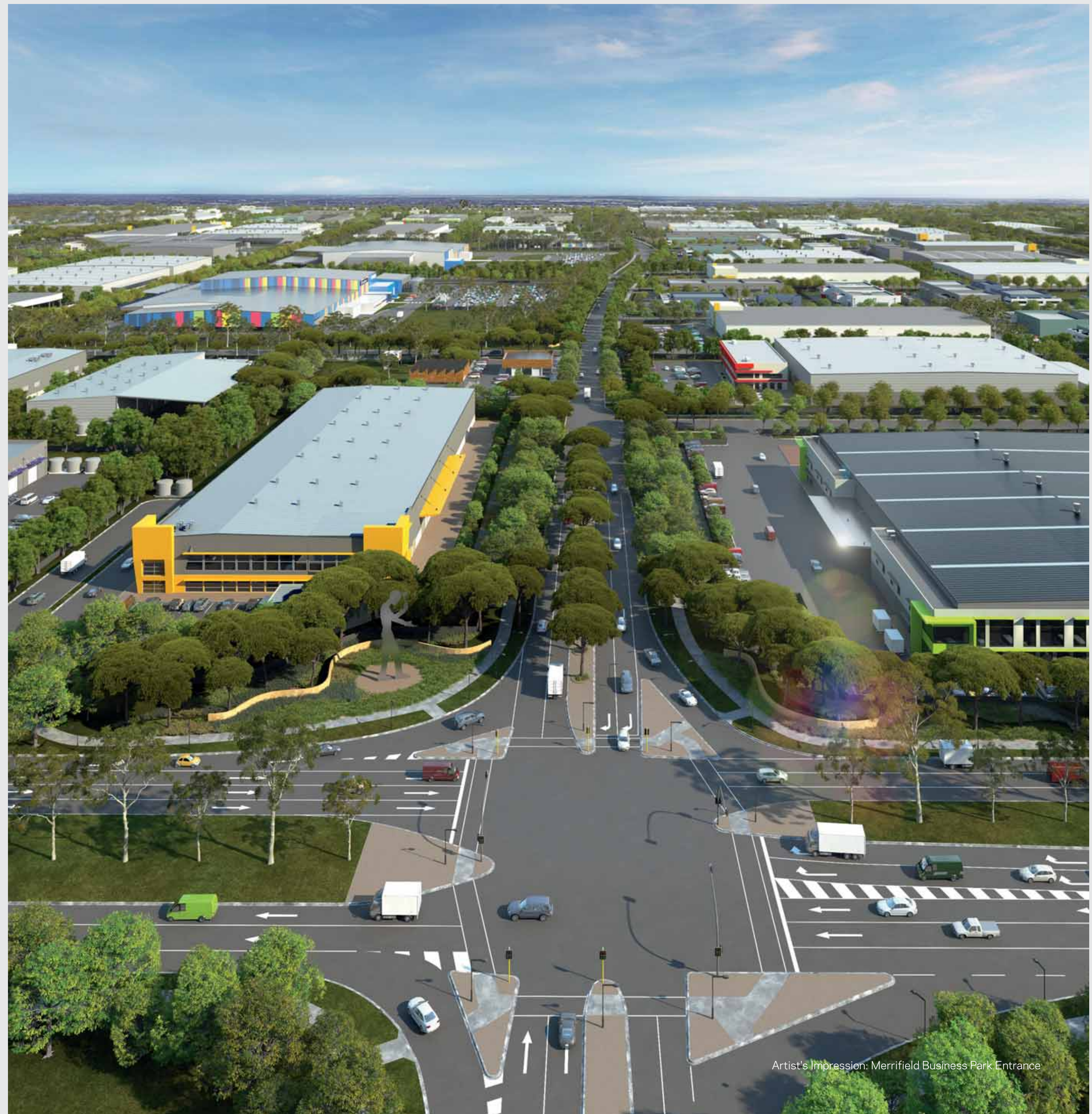
Artist's Impression: Merrifield Business Park Entrance

Planning approved and fully serviced sites are now available. Early construction access options are also available.