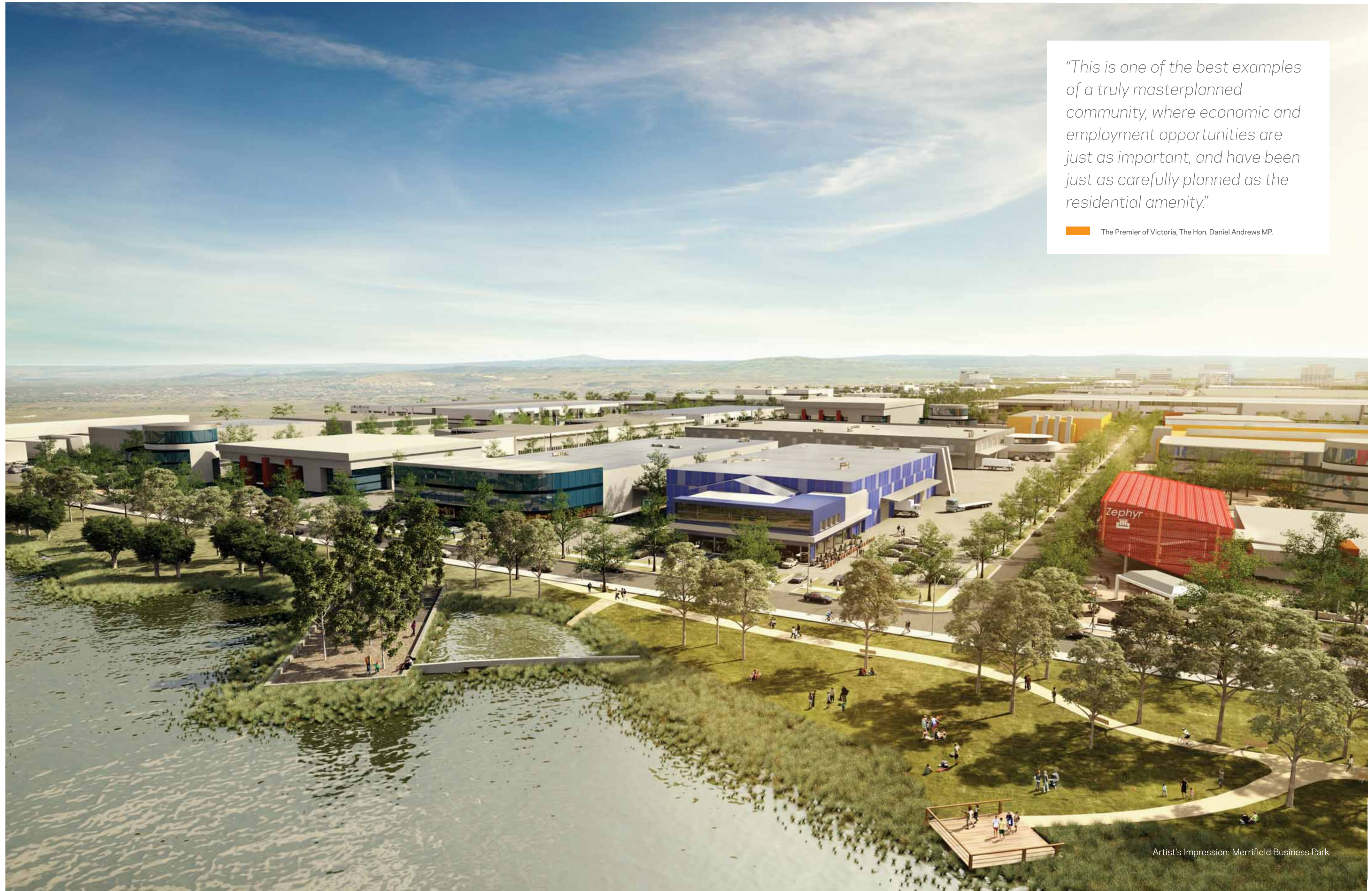
Artist's Impression: Merrifield Business Park